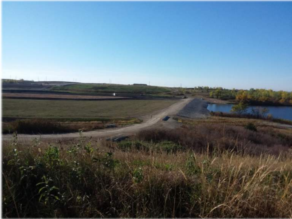
Photograph 1: Vegetation Taking Hold at the Dam Interface Area