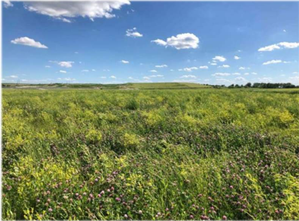
Photograph 5: Established Vegetation Looking Southwest from Northeast Cover Area