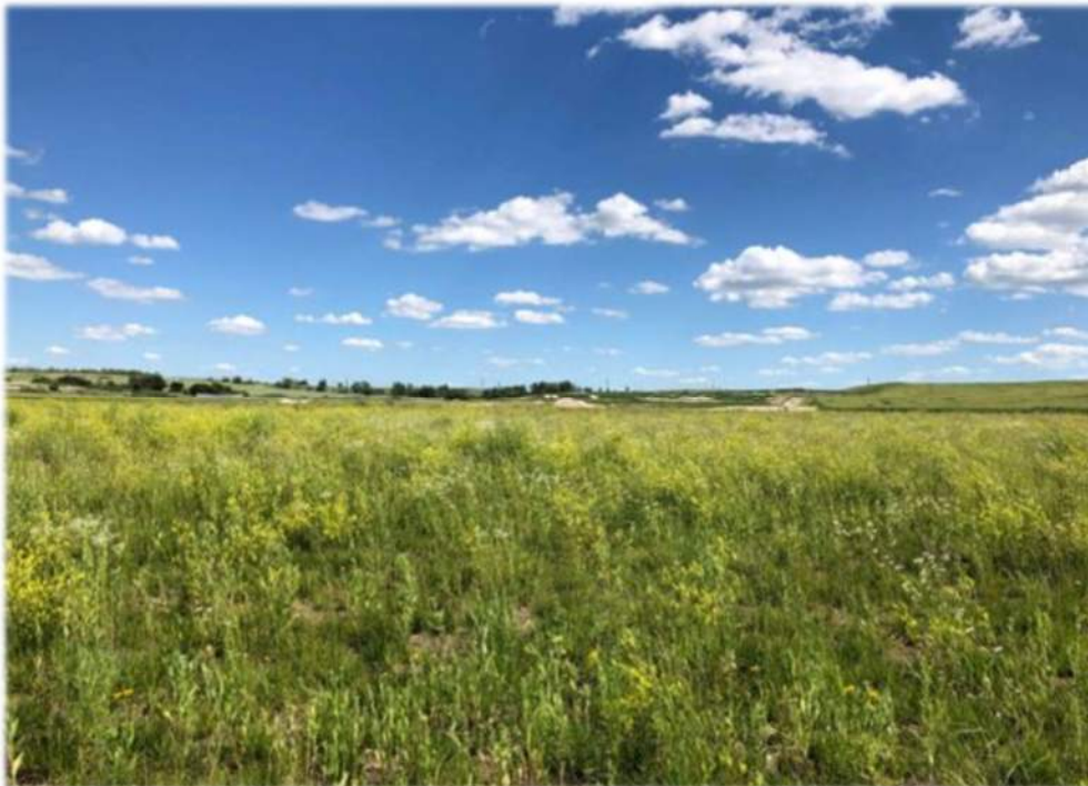
Photograph 2: Established Vegetation Looking South-Southeast from Northwest Cover Area