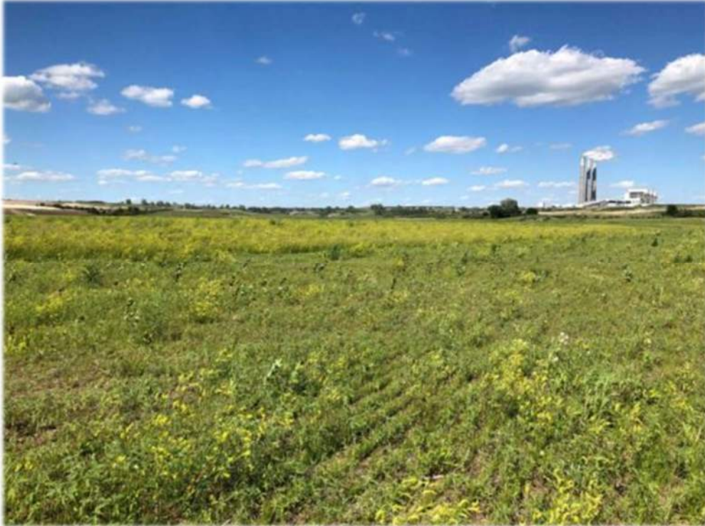
Photograph 3: Established Vegetation Looking Northeast from Dam Area