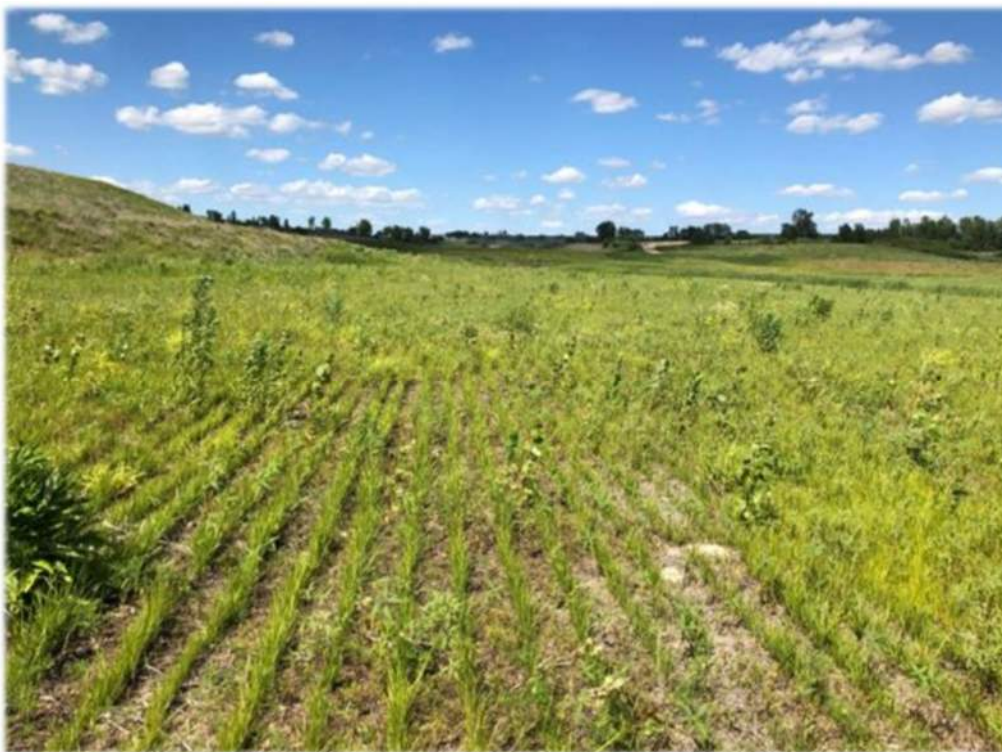
Photograph 4: Vegetation Becoming Established in Northeast Cover Area